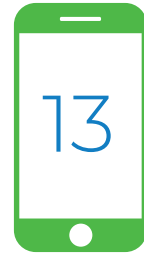
Ages 8+ hours spent online